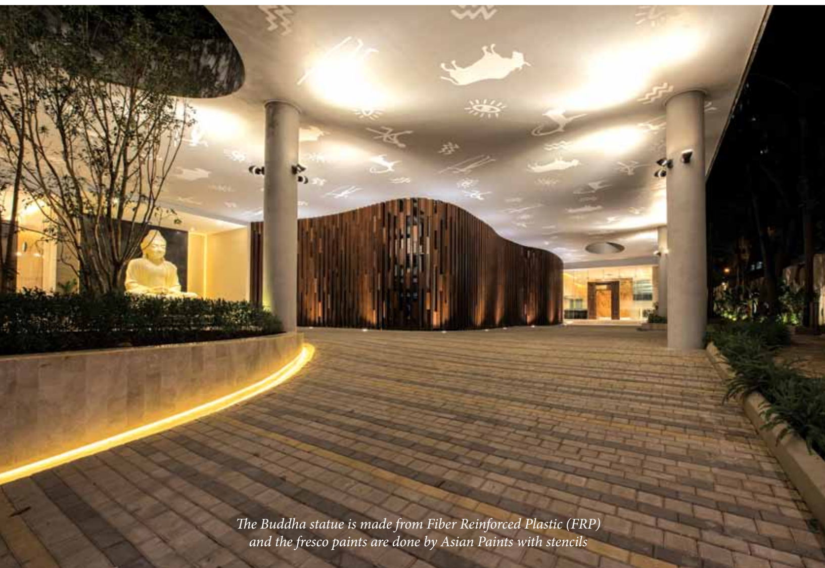
The Buddha statue is made from Fiber Reinforced Plastic (FRP) and the fresco paints are done by Asian Paints with stencils