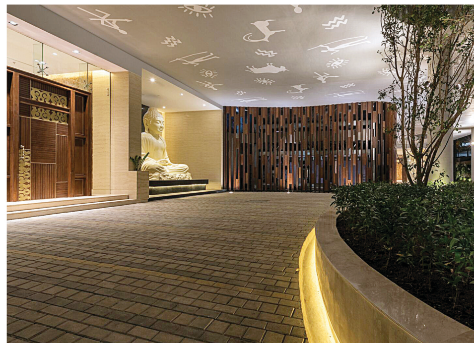
TRADITIONAL MEETS MODERN Aroha, a housing complex, is inspired and integrated with aspects of Buddhist caves in the neighbourhood (right)