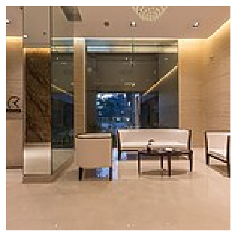
Pentaspace design studio