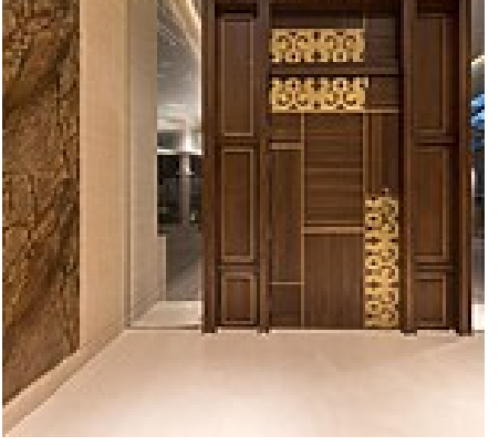
Pentaspace design studio