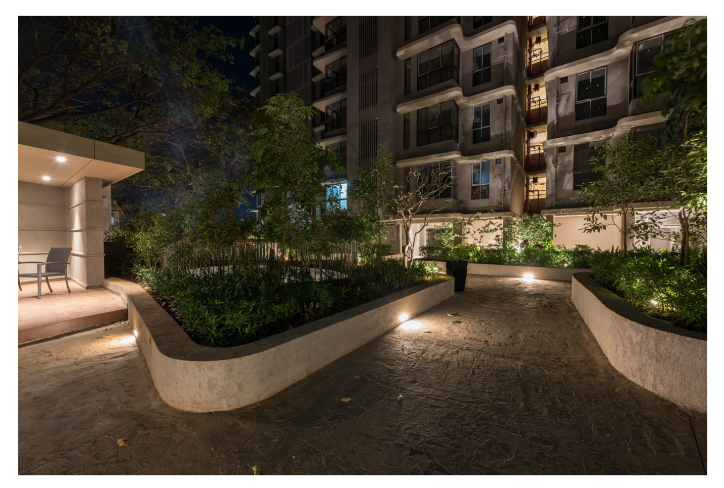
Pentaspace design studio

A long drop-off canopy with cutouts allows sunlight to filter through the space, creating a natural atmosphere.