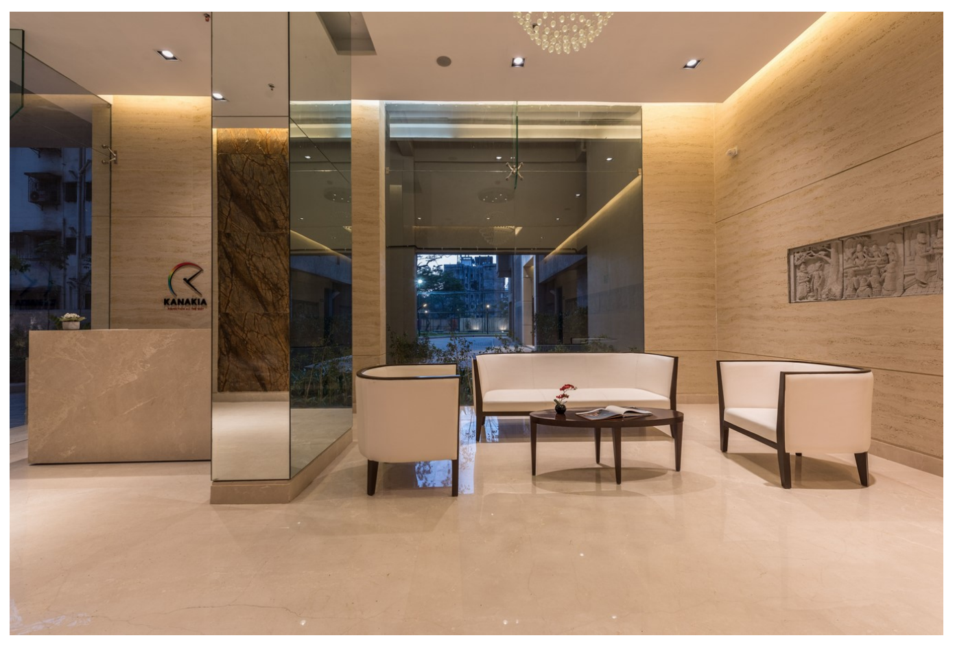
Pentaspace design studio