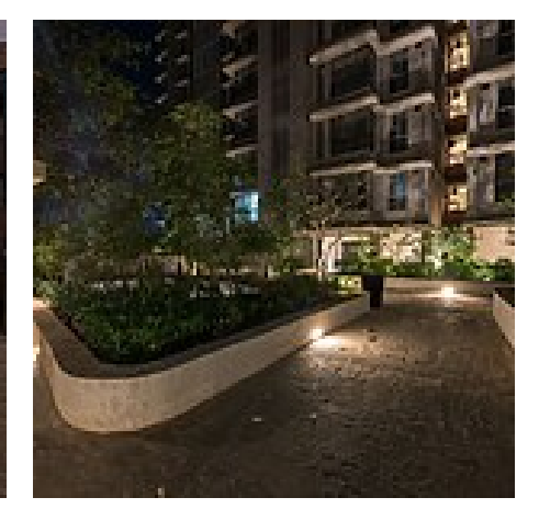
Pentaspace design studio